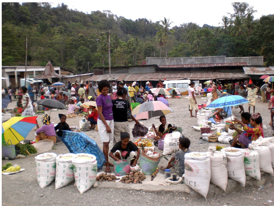
Participants said that the biggest problem is the difficulty of keeping meat, fish and vegetables clean and fresh. Despite this, many Timorese continue to do business selling goods from the roadside stalls, markets, barrows and kiosks.