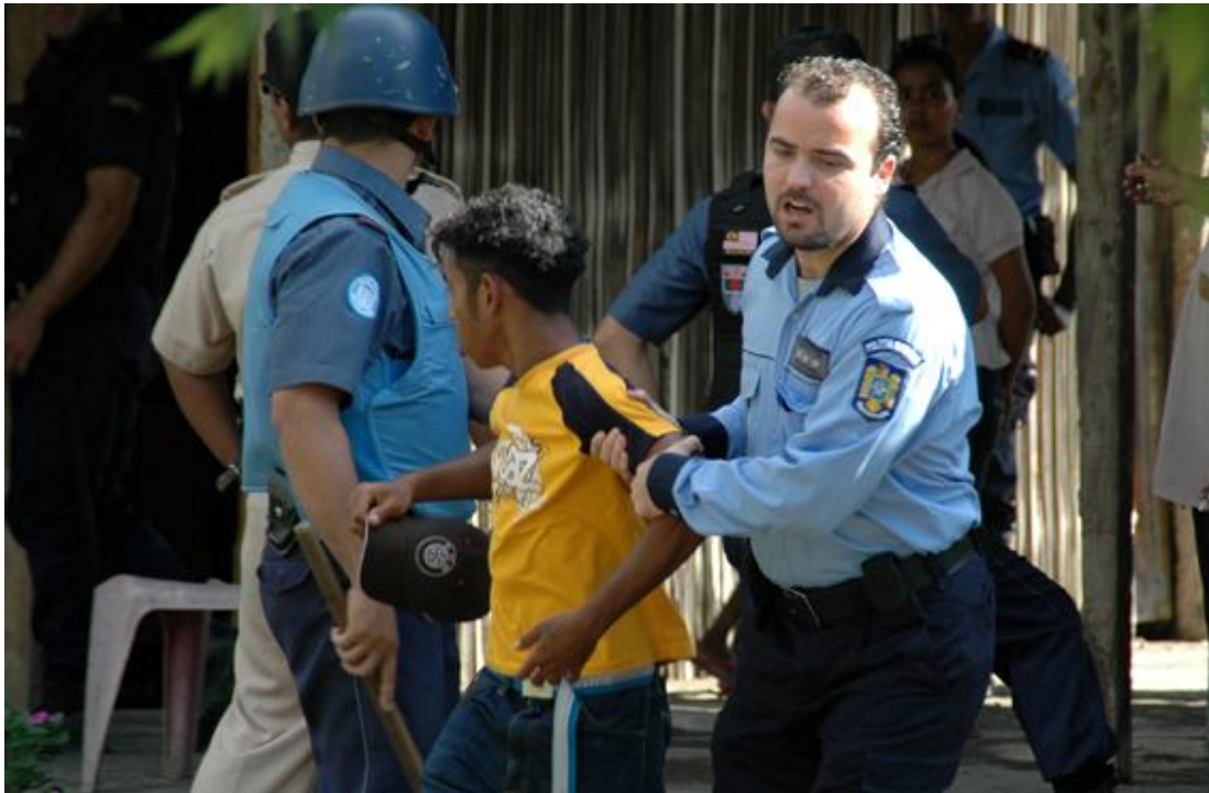
Since independence, communal violence has become a regular feature of Timorese society.

The outbreaks of violence in Ainaro in 2005, Ermera in 2006 and in the capital, Dili, in 2006-7 all had political connotations. In Viqueque, communal violence and intimidation based on ethnic differences between the nauwiti and the makasae occur every year 37 . They then spread to other groups, creating instability throughout the district.