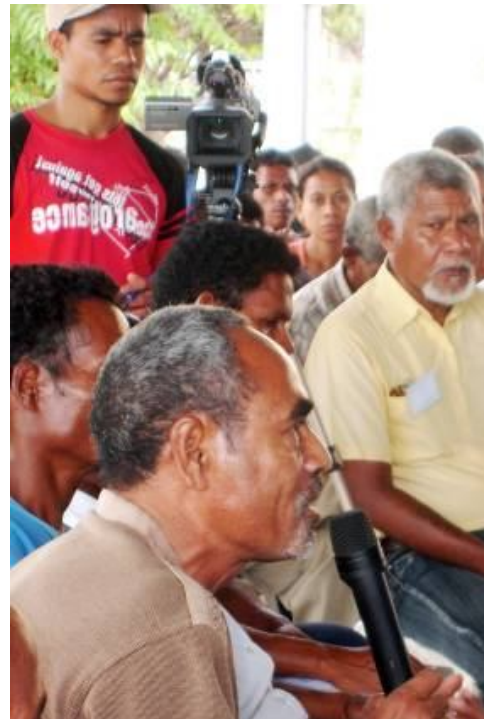
Throughout the programme, video was used as a tool to support the process.

A five month analysis period by the programme team highlighted the complexity and the number of issues that Timorese have to deal with at the various levels. Challenges relating to political leadership and democracy, the legal and judicial systems, social security and social dynamics, and the economy came through strongly in the research. The analysis of participants input has been structured around these four areas.