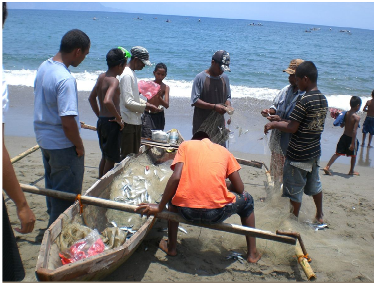
The security of the country's food supplies has become a major issue of concern.

The security of the country's food supplies has become a major issue of concern. There are reports that drought, hurricanes and other natural disasters in many areas mean that people are not able to get enough nourishing food. As a result, their health is at risk and their lives are shortened. They are unable to work harder to improve their standard of living or participate in the social, economic and political development of Timor-Leste.