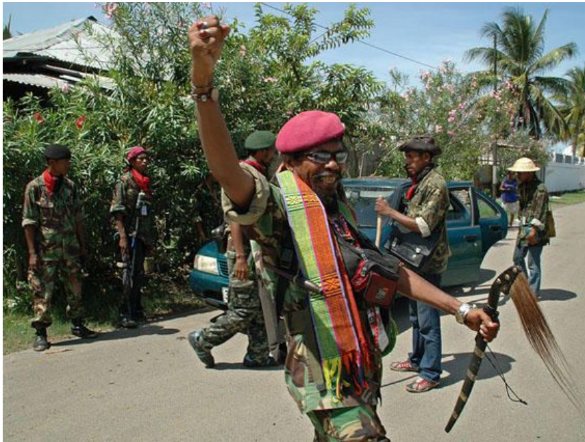
Addressing issues related to veterans is perceived to be of national importance.

Ordinary people involved in the resistance feel that they have been subjected to discrimination and that their contribution to the struggle has been devalued. Reflecting views voiced by participants in another district consultation, a veteran cited that "when we were fighting in the forests, we were told that we would rule the country when Timor gained independence... but today we are not governing; those who lost are ruling once again" 8 .