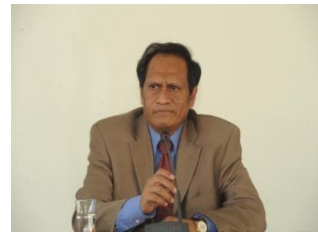
Vice-Prime Minister Guterres pledged the Government’s full support for the programme.

Representatives of academia, the church and other NGOs also participated in good numbers. Perhaps most impressively however, organized delegations from each of the 13 districts (10 participants per district and 15 from the capital Dili) also attended with enthusiasm and demonstrated commitment to ensuring the continued connection of this process to the population in their home districts. This was crucial in real and symbolic terms as the yawning gap between the population and the authorities in Dili is one of the greatest weaknesses facing the country.