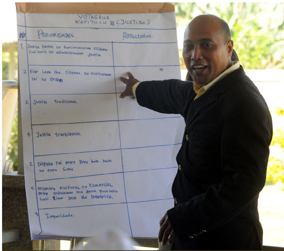
Without a sense of justice, conflict may recur as people are prepared to seek justice themselves if the formal system proves ineffective.

According to participants from families of victims, people are frustrated and angry that there has been no continuity in these processes. Others suggested that past efforts towards reconciliation are unsustainable as they did not result in justice for victims.