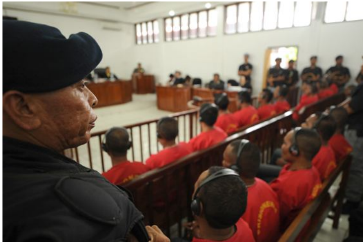
During trials the accused often do not speak or understand Portuguese and have to use interpreters to understand the proceedings.

“In the courts we have international judges who only speak Portuguese. But often the accused only speaks local dialects like Makassae or Waimua. The court’s translators only speak Portuguese and Tetum. This is a big problem.” 62