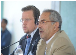
President Ramos-Horta highlighted the “diseases” affecting Timor-Leste and the need to stem the spreading of destructive rumours