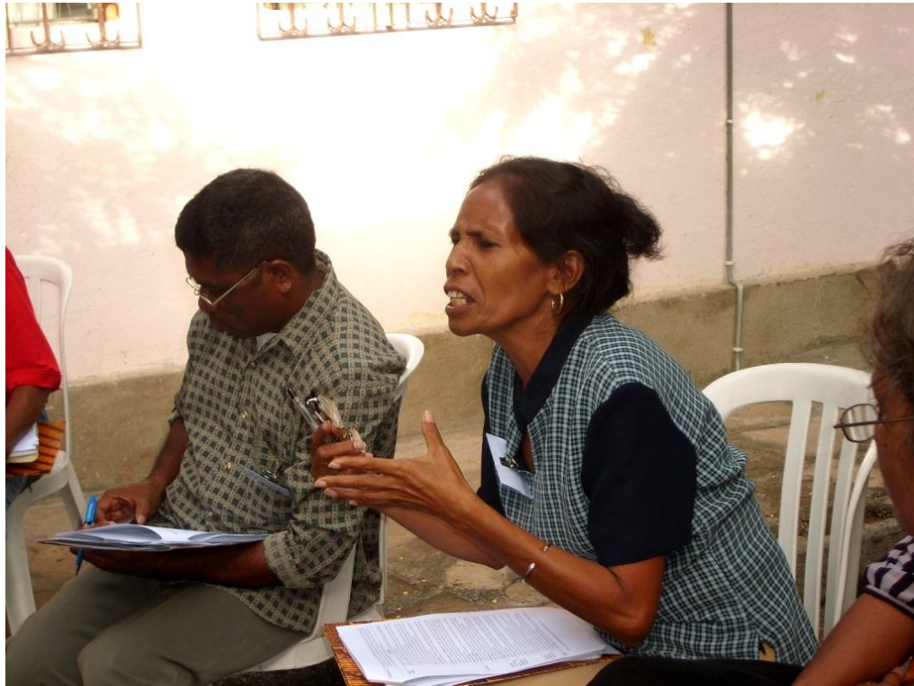
Women have limited access to and control of community resources and are not directly involved in decision making processes.

“... because of the culture, Democracy in Timor is just for men. That is discrimination for women”. 150