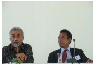
Political rivals Alkatiri (l) and Lasama share a podium, express statements of peace and explain their perspectives on past crises